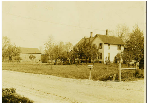
Novak Home, 2016