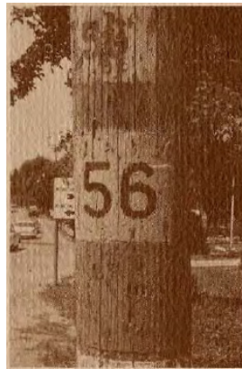
The utility pole at the intersection of Center Rd. and Lake Rd.